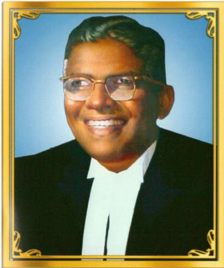
Late Justice K. S. Hegde 1909-1990